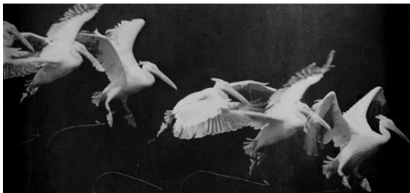
Figure 1: Étienne-Jules Marey, Flight of Pelican, c.1882

Animation may seem to be the most intuitive approach to the depiction of dynamic processes, and may facilitate effective presentations as demonstrated by Hans Rosling in his TED talks [1], but its effectiveness varies depending on the purpose of the visualization. Robertson et al [2] indicate that animation can be effective for presentation tasks, but less so - for analysis, while small multiples techniques lead to faster completion of analytical tasks with fewer errors.